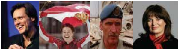
Jim Carrey, Patty Duke - entertainment